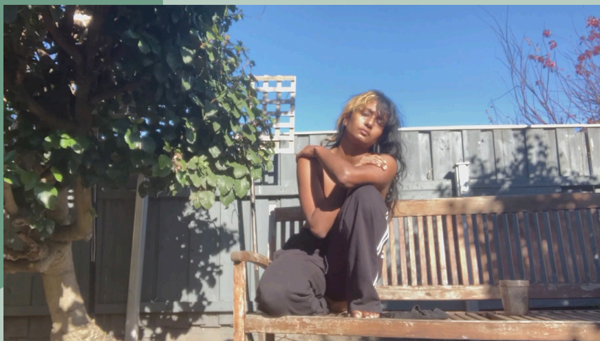
Six Weeks BBY by Senuri Chandrani .