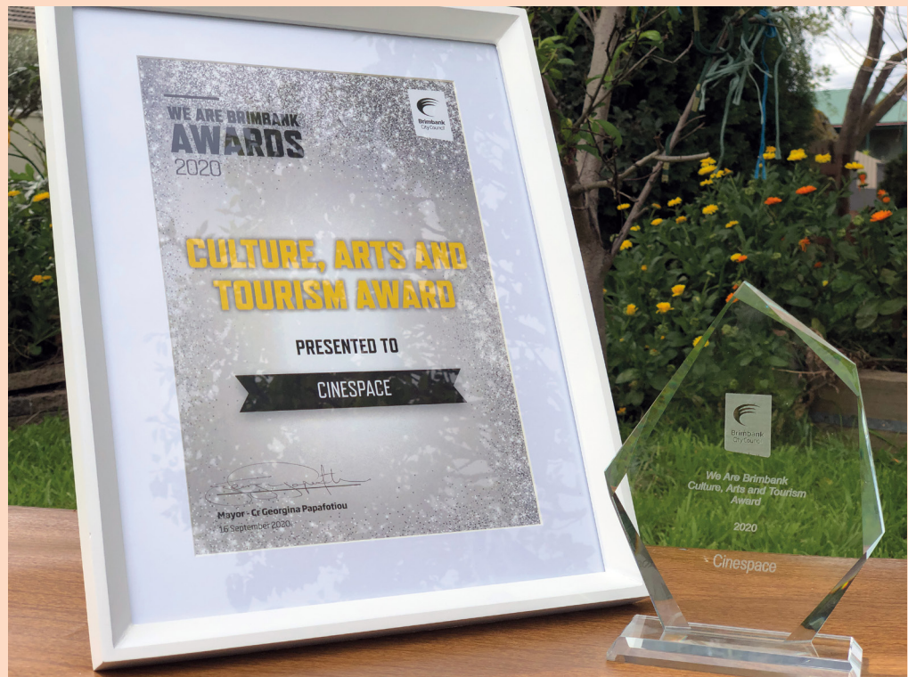
Brimbank City Council Culture, Arts and Tourism Award.